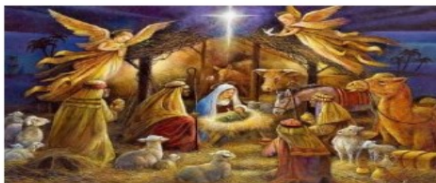
Christmas Mass Times 2022 St John the Baptist Parish